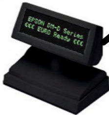
EPSON DM-D110 SERIAL