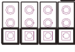
JRS2: Default 2-3 short