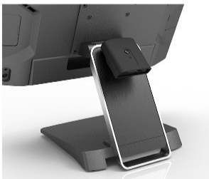
Arm type Barcode Scanner